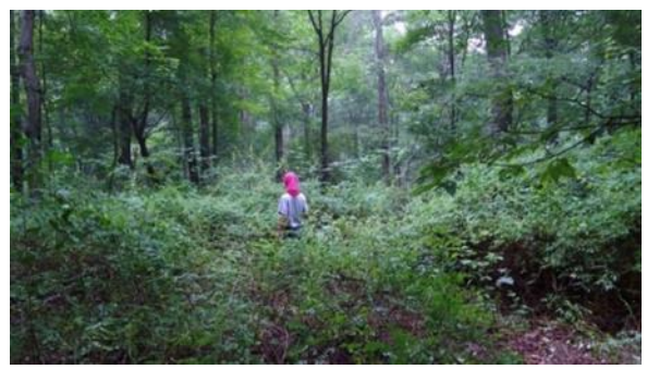
Figure 1. Research plot at the Rutgers Hutcheson Memorial Forest before (above) and after (below) invasive plant removal.