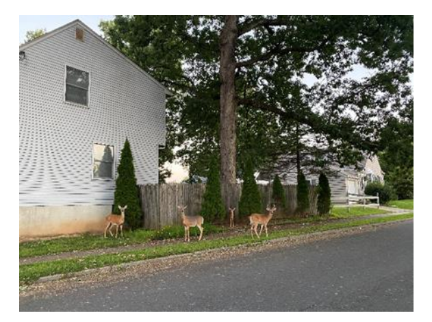
Figure 2. Deer in a residential area of New Jersey.

of invasive plant species that threaten native herbaceous plants and tree seedlings (NJAES 2020). This is illustrated by the photos of a student standing in the same research plot at the Rutgers Hutcheson Memorial Forest before and after invasive plants were removed ( Fig.2 ).