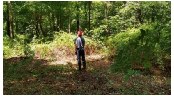
For decades white-tailed deer have been changing the composition of New Jersey forests by eating native plants and facilitating the spread

of invasive plant species that threaten native herbaceous plants and tree seedlings (NJAES 2020). This is illustrated by the photos of a student standing in the same research plot at the Rutgers Hutcheson Memorial Forest before and after invasive plants were removed ( Fig.2 ).