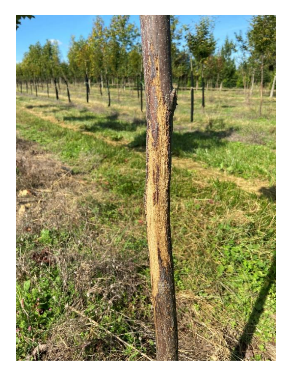
Figure 8. Buck rub. WE RHERE WHEN YOU NEED US

When we visit a tree nursery, we notice that the bark on several of the trunks is damaged ( Fig.9 ).