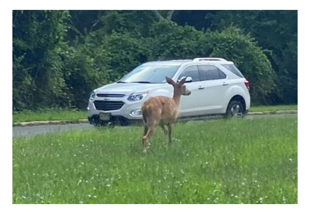
Figure 3. Deer standing by the side of the road as a vehicle drives by.

not realize the damage and the losses that occur ( Fig.6 ).