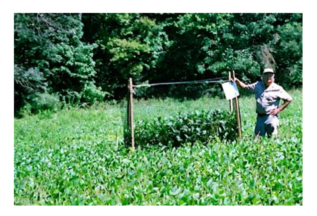
Figure 7. Deer damage to soybeans.

"What I tell nonfarmers – if you want us here, we can't be here with all the deer. Imagine taking 10 to 15% of gross income every year and feeding it to the deer. Some farmers lose as much as 40% per year. A lot of us are disappearing."