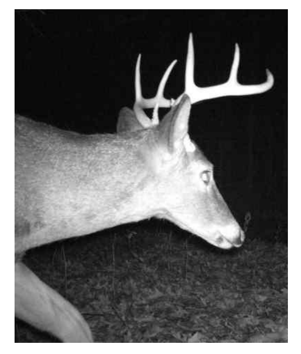
Figure 9. Antlered buck.

Try thinking of it like this - after working around the clock for months, investing all your time, energy, and money into your job or business, someone just takes 10-25% of your paycheck. You don't make any profit that year. You're tired, frustrated, depressed, and just don't know if the thing you have loved doing your whole life, is worth doing anymore at all. These are just some of the ways that white-tailed deer are impacting our farmers' lives in New Jersey.