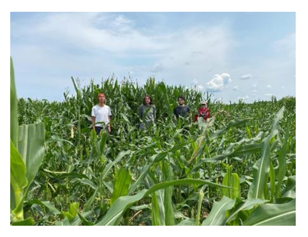
Figure 5. Students help to demonstrate extreme deer damage to corn.

We fail to recognize that the farmers we see out in the fields were up much of the night dealing with deer that were eating their crops.