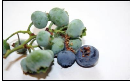
Picture 2. CBFW damage to developing fruit.

Monitoring: The timing of treatment can be determined based on data collected from pheromone traps. According to a degree-day model from Michigan State University, it takes approximately 85 degree-days from the first male capture (known as the biofix) to egg laying. The number of males captured in the traps offers valuable information on the presence and distribution of CBFW within a field. Typically, traps are positioned at the wooded borders of fields, where CBFW pressure tends to be high. Growers with a history of high CBFW populations