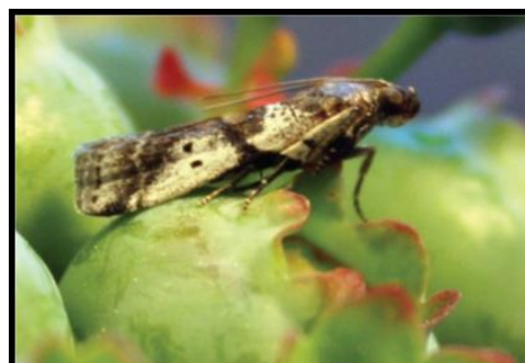
Picture 1. CBFW adult.

Life Cycle: CBFW completes one generation per year. It overwinters as a fully-grown larva within a cocoon made of silk and soil particles, known as a hibernaculum. Pupation occurs in early spring, with moths beginning to emerge during the second to third weeks of May. Male moths emerge 3-4 days earlier than females. Adults are brownish-gray with a pair of white markings on each forewing (Picture 1).