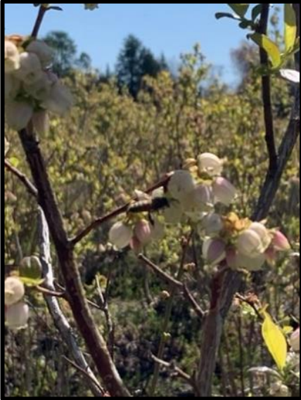
Picture 3. Blooming blueberry bushes.

With some of the sunnier days we had this week, honey bees appeared active in the fields. Warmer temperatures are expected next week which should be favorable for bee activity in blooming blueberry bushes (Picture 3).